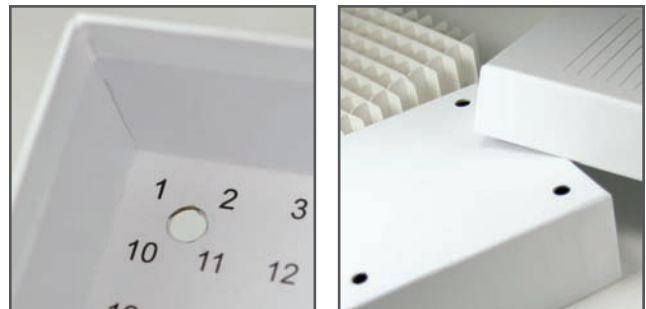
Weep holes drain liquid and reduce moisture build-up resulting in longer box life.